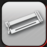
C. CLIP (PATENT PENDING)