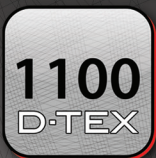
1100 D-TEX TECHNORA MEMBRANE